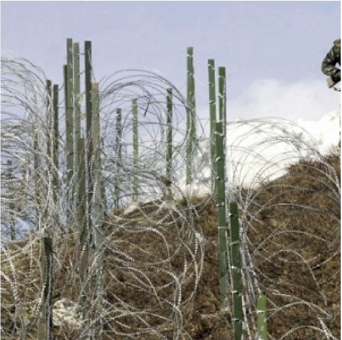
INDIA 4 Pakistan posts destroyed in firing across LoC in Keran sector, heavy casualties inflicted: Army